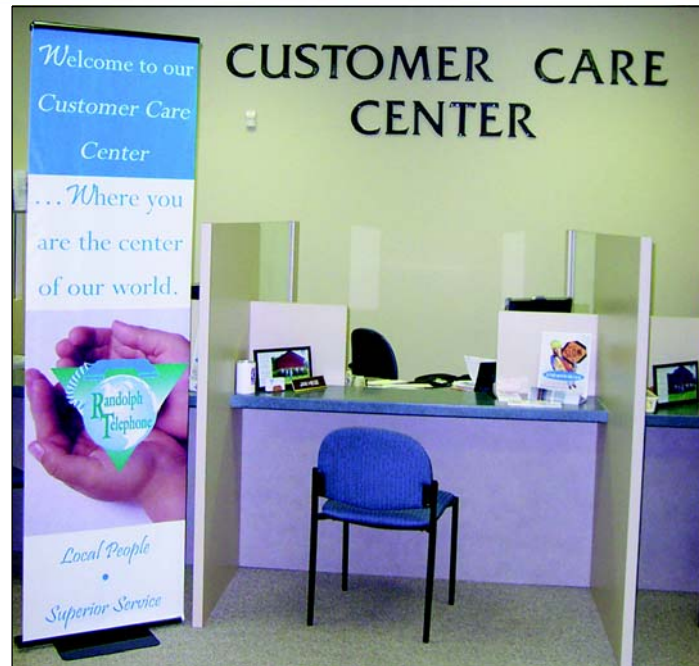
A new office name, but the same terrific service!

Feel free to call us any time with feedback on our services or products you'd like us to offer. ☐