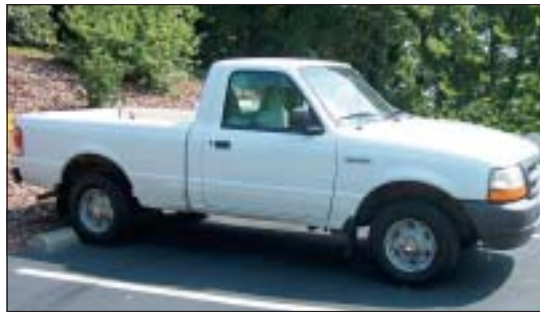
1 of 2 1998 Ford Ranger Pick-Up Trucks