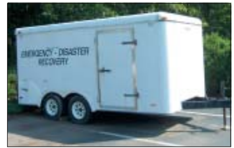
14-Foot Tandem Enclosed Trailer