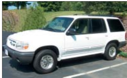
2001 Ford Explorer with 99,160 miles